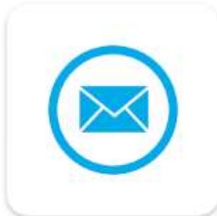
Microsoft Outlook Mail